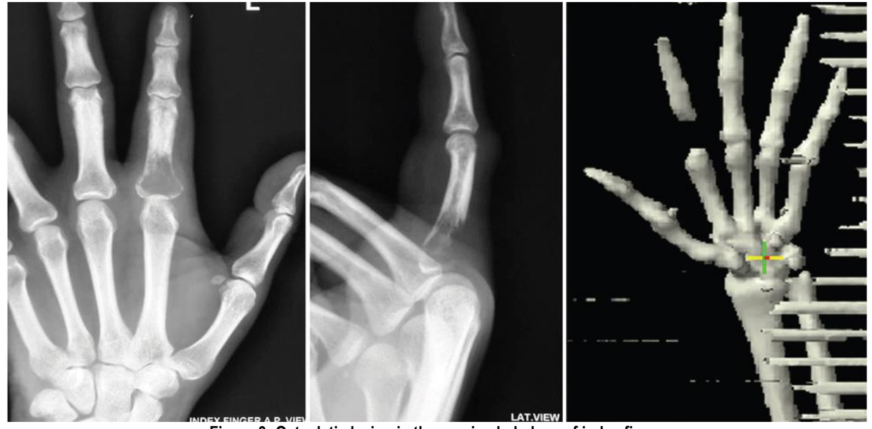
Figure 3: Osteolytic lesion in the proximal phalanx of index finger