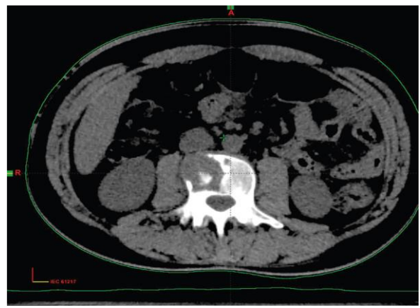
Figure 2: Osteolytic lesion in the lumber vertebra

more common in males than in females with a ratio of 4:1. Tobacco chewing and bad oral hygiene was the main causative factor. Carcinoma buccal mucosa was more common in younger age group with a median age of 45 years. 87% patients presented in stage III and IV and 75% of patients reported after surgery for adjuvant treatment.